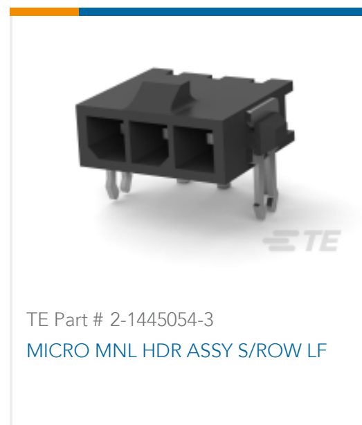
TE Part # 2-1445054-3 MICRO MNL HDR ASSY S/ROW LF