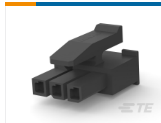
TE Part # 1445022-3 MICRO MNL RFECEPT HSG SINGLE R