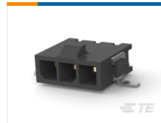
TE Part # 2-1445100-3 MICRO MNL HDR ASSY S/ROW LF