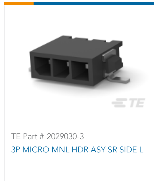
TE Part # 2029030-3 3P MICRO MNL HDR ASY SR SIDE L