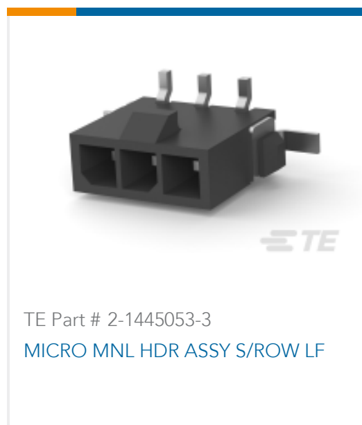
TE Part # 2-1445053-3 MICRO MNL HDR ASSY S/ROW LF