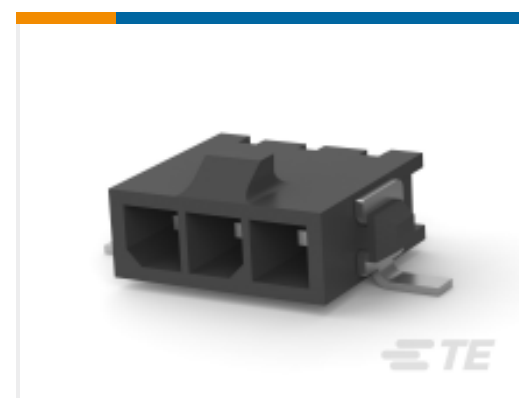
TE Part # 2-1445057-3 MICRO MNL HDR ASSY SINGLE ROW