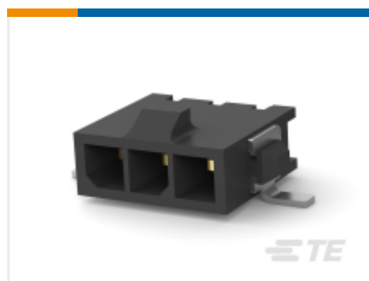
TE Part # 2-1445091-3 MICRO MNL HDR ASSY S/ROW AU LF