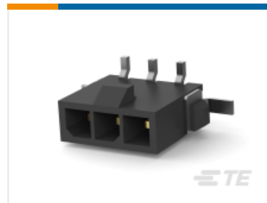
TE Part # 2-1445087-3 MICRO MNL HDR ASSY S/ROW AU LF