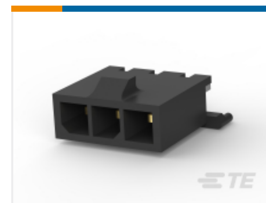
TE Part # 2-1445093-3 MICRO MNL HDR ASSY S/ROW AU LF