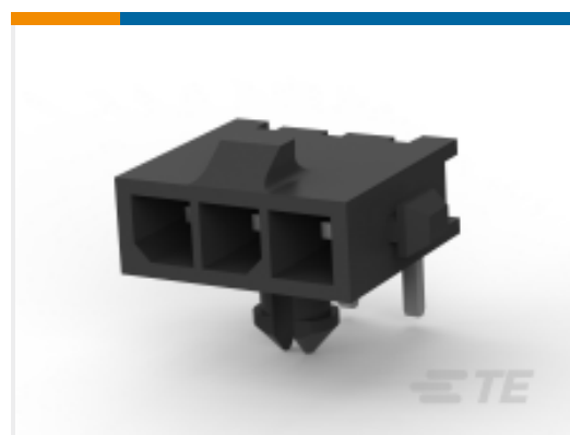
TE Part # 2-1445055-3 MICRO MNL HDR ASSY S/ROW LF