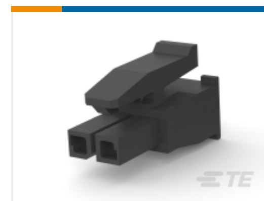
TE Part # 2008571-2 2 POS MICRO MNL, TOP LATCH, BL