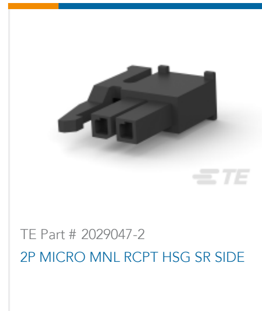
TE Part # 2029047-2 2P MICRO MNL RCPT HSG SR SIDE