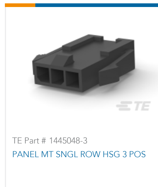
TE Part # 1445048-3 PANEL MT SNGL ROW HSG 3 POS