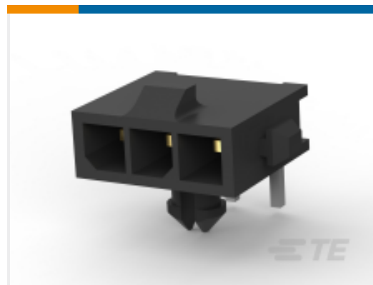
TE Part # 2-1445098-3 MICRO MNL HDR ASSY S/ROW AU LF