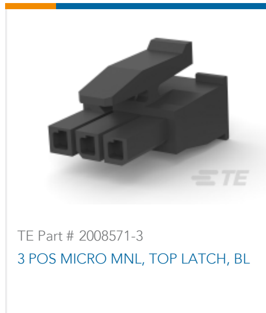
TE Part # 2008571-3 3 POS MICRO MNL, TOP LATCH, BL