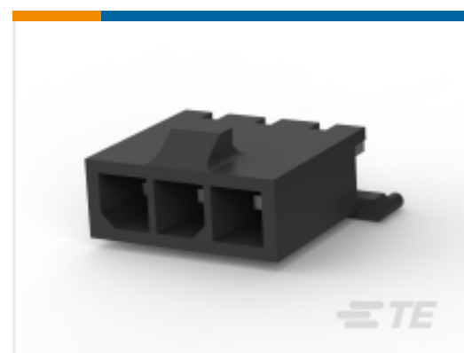
TE Part # 2-1445050-3 MICRO MNL HDR ASSY S/ROW LF