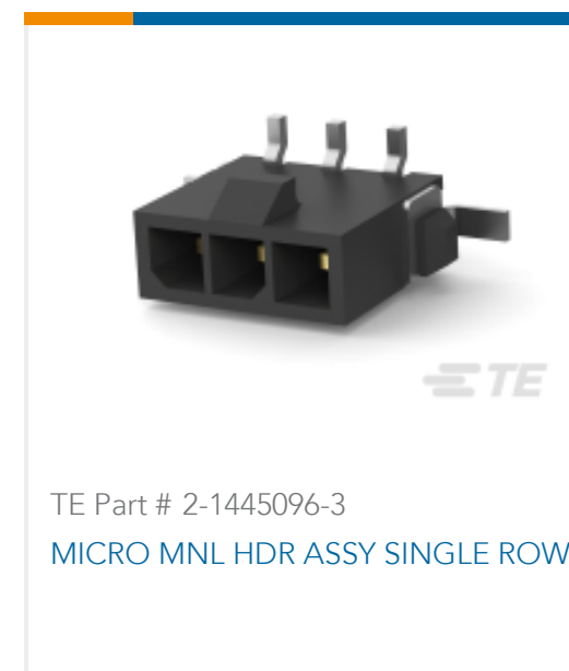
TE Part # 2-1445096-3 MICRO MNL HDR ASSY SINGLE ROW