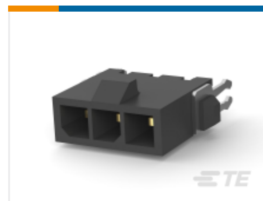
TE Part # 2-1445094-3 MICRO MNL HDR ASSY S/ROW AU LF