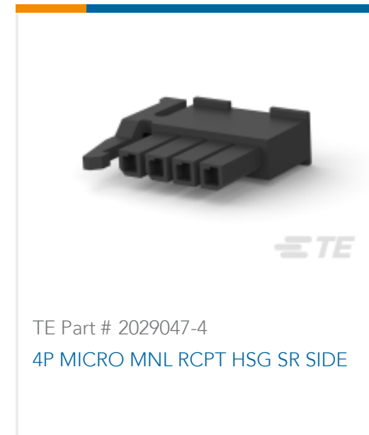
TE Part # 2029047-4 4P MICRO MNL RCPT HSG SR SIDE